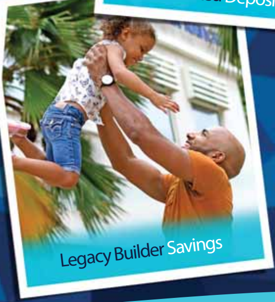
Legacy Builder Savings

Enjoy your banking experience with a Cayman National personal account that's designed with you in mind. Our new deposit accounts give you the freedom, flexibility and peace of mind that you deserve. Visit caymannational.com or stop by one of our locations to learn more and take advantage today.