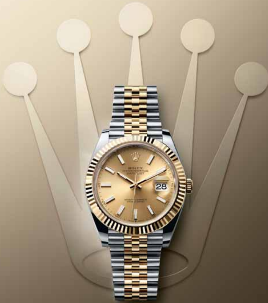
OYSTER PERPETUAL DATEJUST 41